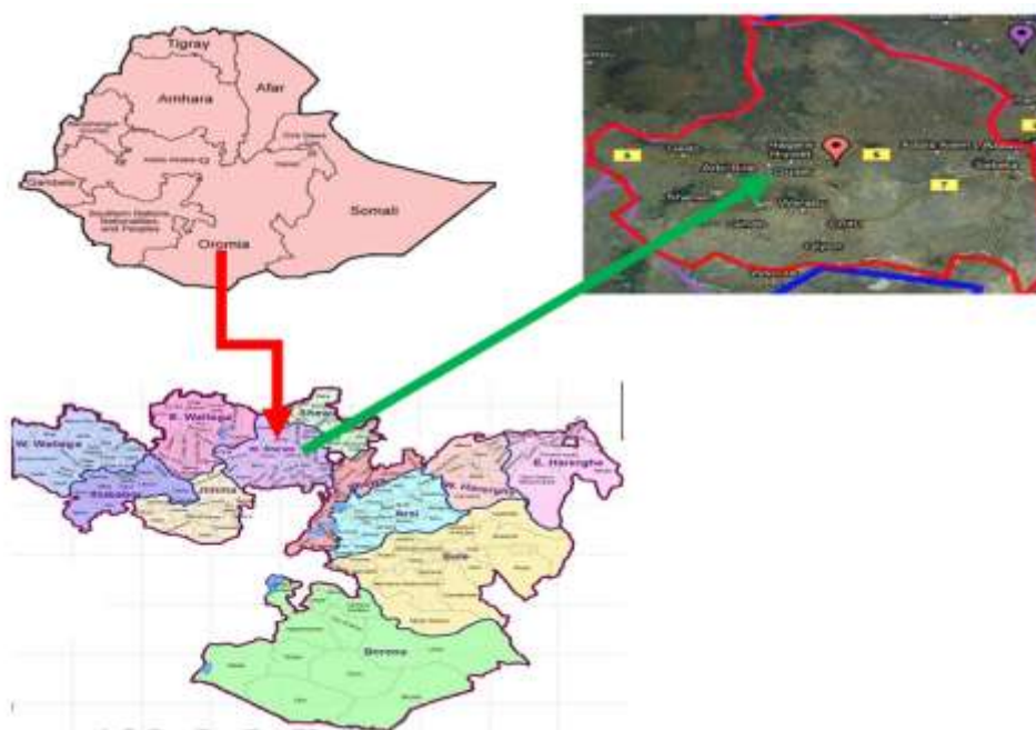
Figure: 2.1: Foundation of Gudar town

Gudar town is found in Oromia region of West Shoa zone, 10 km from Ambo town. A cross sectional survey on the quality of river Gudar for drinking purpose using different laboratory analysis was carried out. Similarly some heavy metal analysis of the river water was analyzed.