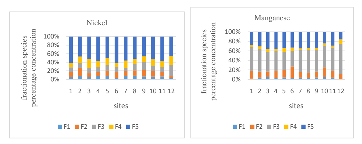
Figures 1-8: Fractionation species percentage concentration