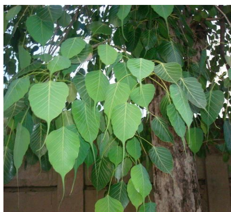
Figure: 5- Pipal