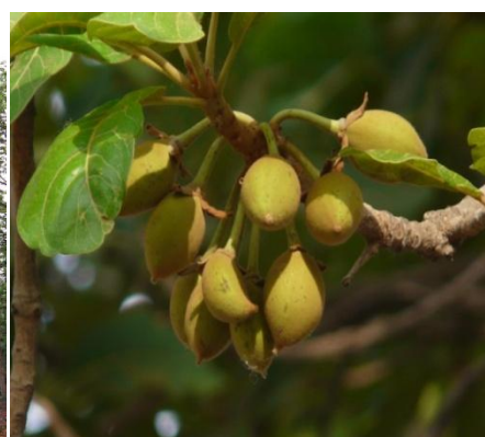
Figure: 4- Mahua