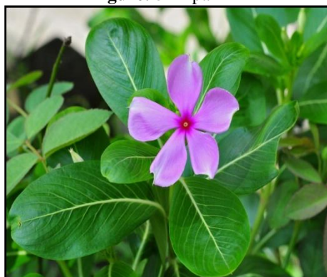
Figure: 7- Sadabahar