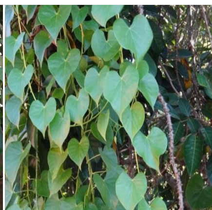
Figure: 6- Giloy