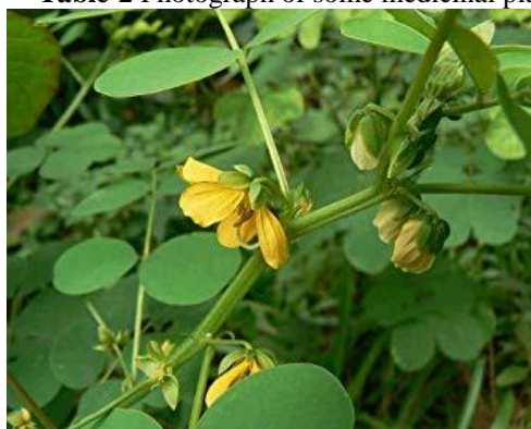
Figure: 1- Charota