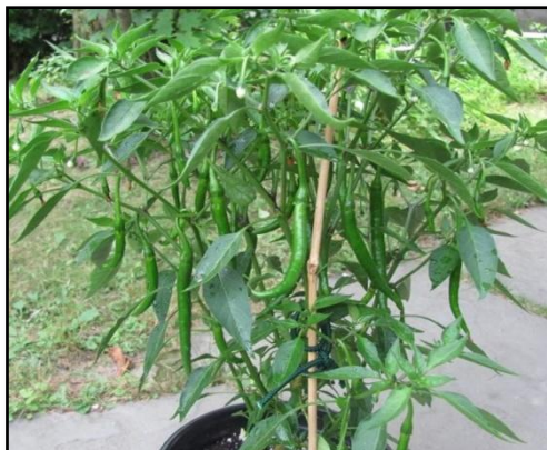
Figure: 9- Mirch