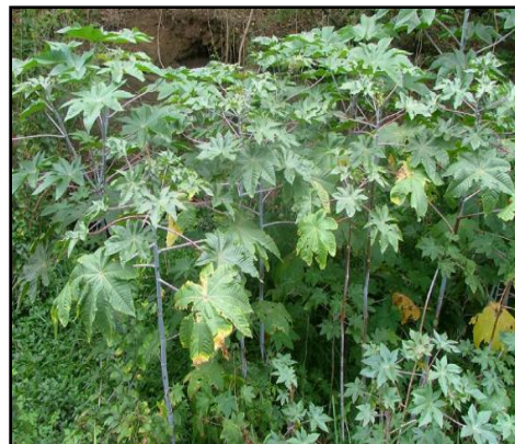
Figure: 10- Jada