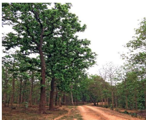
Figure: 3- Sal