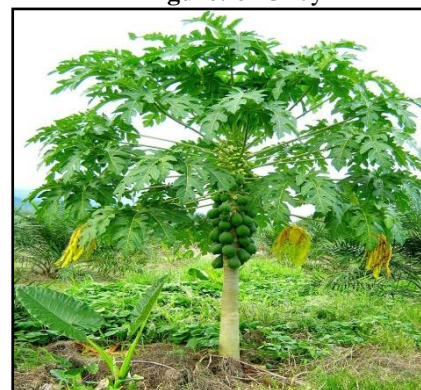
Figure: 8- Papita