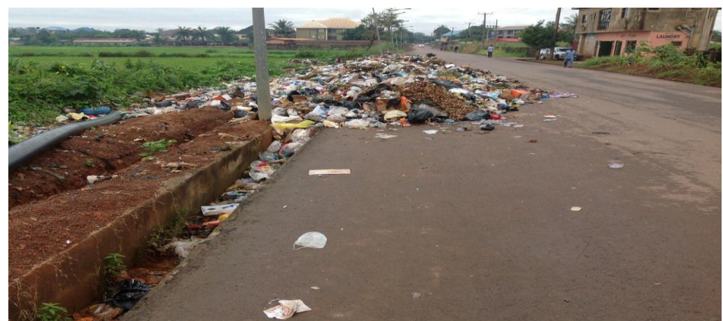
Figure 3: Blocked water ways due to indiscriminating dumping of waste at Nnorom Street ACT.