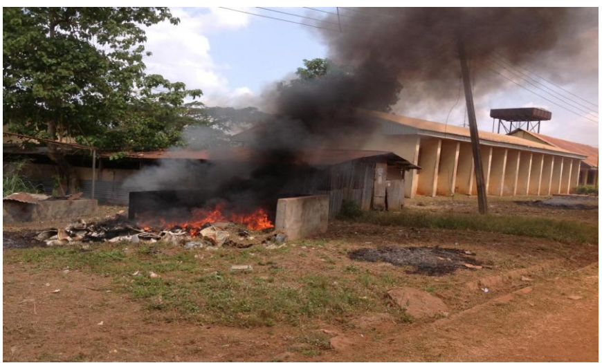
Figure 5: Open burning of waste in Abakaliki Capital Territory (ACT)

In addition to burial, open burning is a popular method of waste disposal in ACT, though not recognised by EBSEPA. Investigation as to way many people prefer to burn their waste instead of taking it to waste dump revealed that many people who do this claim to be busy or do not have children to do it and moreover, it is faster. Whilst this approach might be a faster means of waste disposal, the environmental and health risk must be considered. Figure 5 shows open waste burning in ACT.