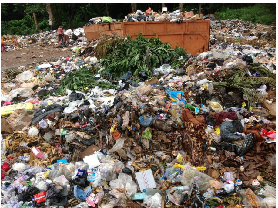
Figure 4: Waste dump at Water-works ACT showing decomposing waste calling for attention,