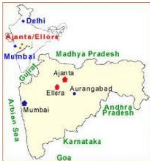
Figure 1: Location of the study area

2.1 Study Area: The Ajanta Caves (Latitude: 20°32'N, Longitude: 75°45'E) are situated in Aurangabad District of the Maharashtra State in India. The study area covers approximately 16 km radial distance from the centre. The Caves at Ajanta were recognized as one of the most spectacular, sublime and historic aesthetic mural creations in the world. Figure 1 shows the location of the Ajanta Caves in Maharashtra state.