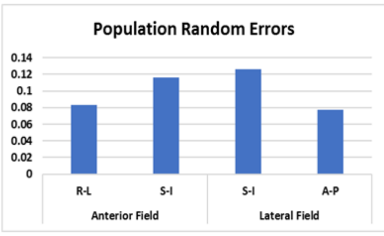
Figure, (2) The Population Random Error in Anterior and Lateral fields