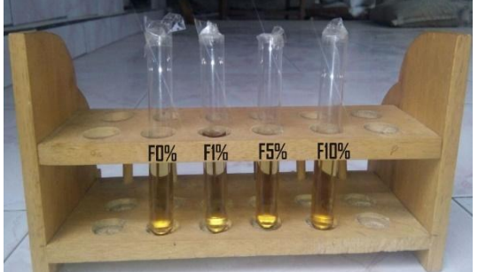
(a) (b) (c) (d)

Figure 1. Results of Sol-Gel-Varying concentrations from left to right with a concentration(a) undoped, (b) F : SnO2 (1 : 99)%, (c) F : SnO2 (5 :95) % and (d) F : SnO2 (10 : 90) %.