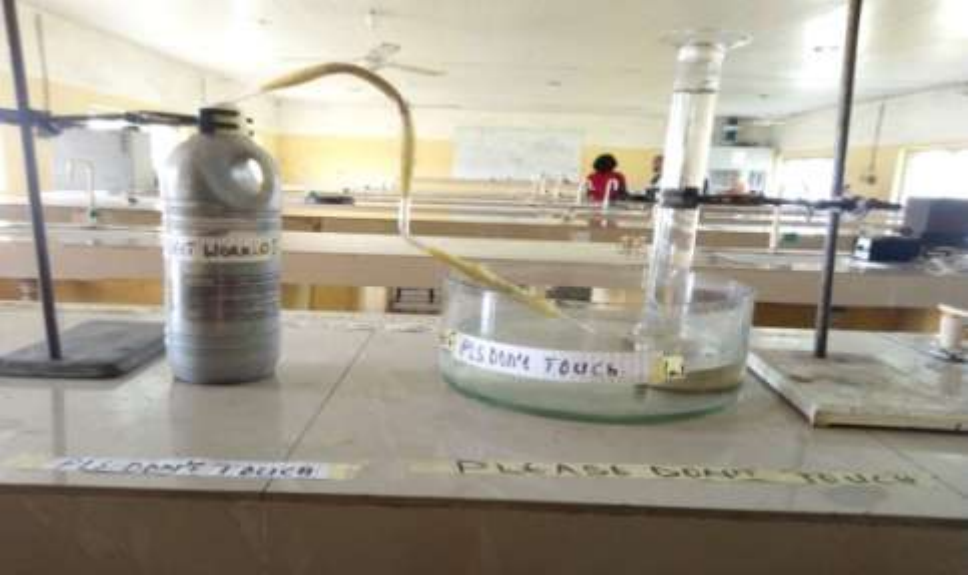
Figure 2: Experimental Set-Up For Biogas Production

MEASURING THE AMOUNT OF GAS PRODUCED AT THE END OF THE EXPERIMENT; At the end of the experiment, the quantity of biogas produced was determined using the measuring cylinder reading.