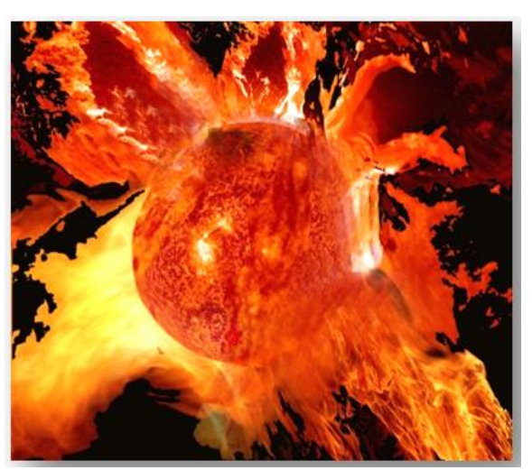
Gasolier Explode Mass for Huge

It was proved that the sun is a big ball of gases; it is the central object in the solar system, it is made up of different gases, the sun is the richest source of electromagnetic energy in the solar system (mostly in the form of heat and light). This is more better to say about the chemical composition of the sun; incase chemical composition is highly enriched and then sun will become Of misbalance in that case earth will be appear to tremendous danger and it will make a solar cyclone, so men have to conscious and keep our mind, the sun will be explode and divided into the many portion, because large quantity of gases growth in the inner part of the sun and the earth and solar system would be destroyed. Unlike tornadoes on earth, which are powered by differences in temperature and humidity the twisters on the sun are combination of hot flowing gas and tangled magnetic field lines, ultimately drive by nuclear reaction in the solar core.