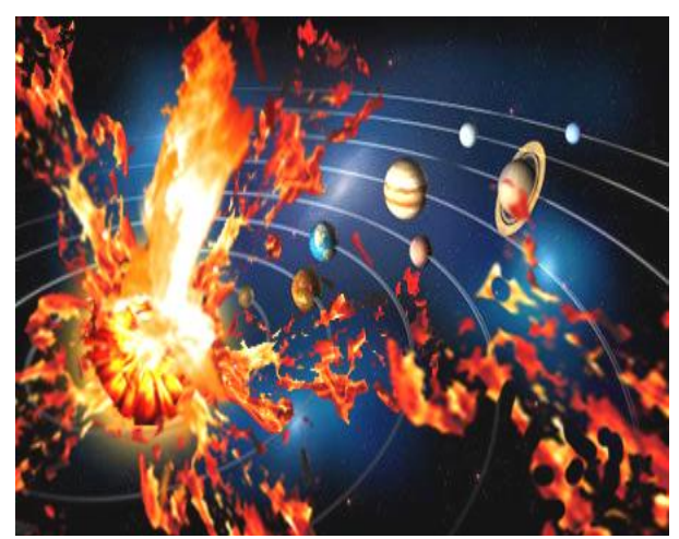
Damage others Planetory System

At present we have seen in the world the many forest region have been burn out. It is happening for the action of gaseous, there are promoted any combustible, (anything that will take fire and burn) .As much the earth will be heated and as such the world will be fulfilled to the gases.