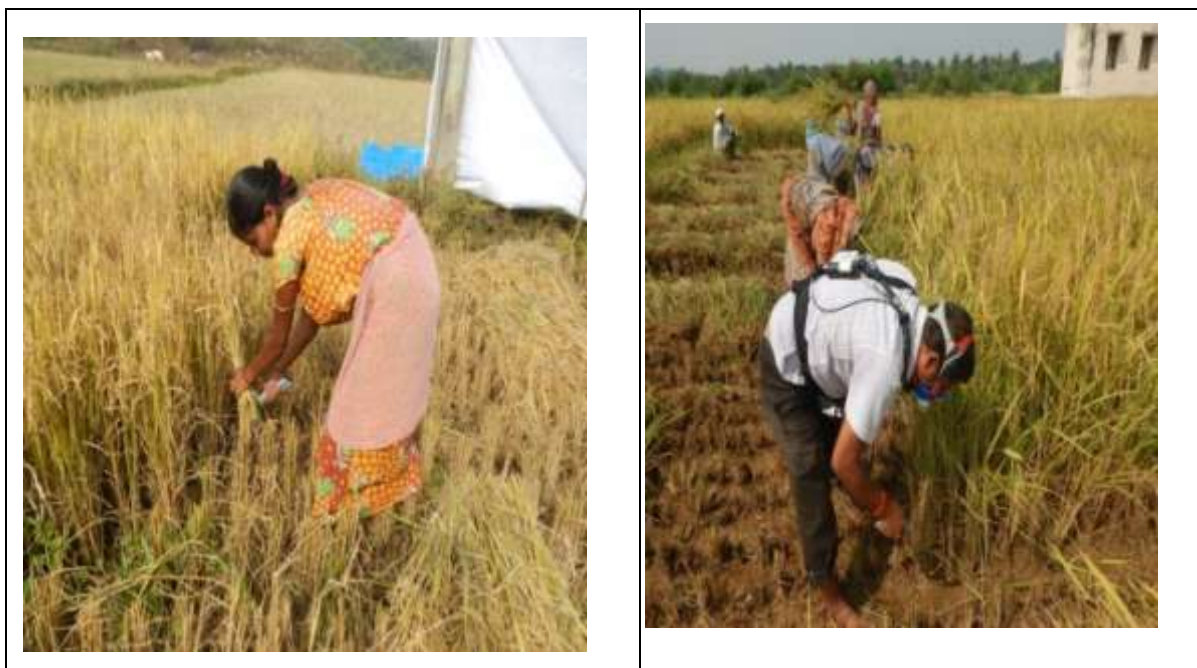
Fig 3: Bending posture adopted during harvesting of rice

During harvesting operation, the bending posture was adopted. The bending angle increases with stature of men and women subjects. It was observed that, subjects with high stature, 104^{\circ} highest in ACZ 10 , followed by 102^{\circ} in ACZ 2 and lowest 83^{\circ} in ACZ 3 . While comparing bending angle with stature, it was observed that the stature of ACZ 10 , ACZ 2 , ACZ 3 decreases. Using a 10 point Visual Analog Discomfort (VAD) scale, the body parts discomfort 5.5 in ACZ 5 and ACZ 9 and lowest in ACZ 1 , ACZ 2 and ACZ 7 . Adopting the bending posture, the harvesting capacity was varied from 71 to 89 m 2 /h. So that to cover 1 acre of land 44 hours or 7.2 man-hours per acre is required for male. The body parts filling maximum discomfort was observed in waist, thigh, shoulder, right hand for both men and women workers. The relative cost of work load was observed to maximum 40.8 per cent of male workers in ACZ 10 female workers 38.4 per cent in ACZ 1 this indicated the fatigue of the workers. It is also observed that with increase in weight of a sickle the relative cost of work load also increases.