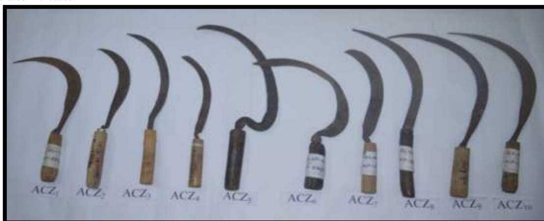
Fig 4: Figure of Sickles from ten agro-climatic zones of Odisha

During harvesting operation, the bending posture was adopted. The bending angle increases with stature of men and women subjects. It was observed that, subjects with high stature, 104^{\circ} highest in ACZ 10 , followed by 102^{\circ} in ACZ 2 and lowest 83^{\circ} in ACZ 3 . While comparing bending angle with stature, it was observed that the stature of ACZ 10 , ACZ 2 , ACZ 3 decreases. Using a 10 point Visual Analog Discomfort (VAD) scale, the body parts discomfort 5.5 in ACZ 5 and ACZ 9 and lowest in ACZ 1 , ACZ 2 and ACZ 7 . Adopting the bending posture, the harvesting capacity was varied from 71 to 89 m 2 /h. So that to cover 1 acre of land 44 hours or 7.2 man-hours per acre is required for male. The body parts filling maximum discomfort was observed in waist, thigh, shoulder, right hand for both men and women workers. The relative cost of work load was observed to maximum 40.8 per cent of male workers in ACZ 10 female workers 38.4 per cent in ACZ 1 this indicated the fatigue of the workers. It is also observed that with increase in weight of a sickle the relative cost of work load also increases.