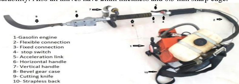
Fig .1 vibration motorized cutter

The experiment was conducted for testing three types of locally manufacturing A, B and C under cutting angle knives degrees included, 45°, 60° and 90° were used in this study. Assembly motorized vibration generator with bevel gear case used to vibrate the knife in 3000-5000 rpm and movement knife stroke about 1.6 cm, (fig.1). Knives was manufacturing by hot forge in local workshop using the (ASTM579) alloy, this material consider a high a durability. Also all knives have 2mm thickness and 0.5 mm sharp edge.