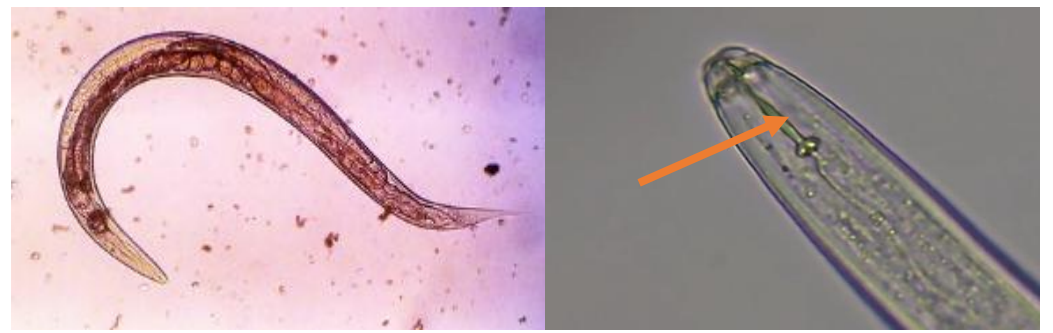
Plate 1a. Meloidogyne incognita .

nematode in most African countries. It exhibits sexual dimorphism with the female being distinct and easily distinguishable from the male. The female has a soft globose body that may be 0.4-1.3mm in length and that terminates in vulva and anus. A short stylet occurs anteriorly with a small basal knob. The ovary is conspicuous and occupies most of the body cavity. It produces eggs which are laid in egg sacs produced from the rectal glands. A characteristic circular marking usually found in the perineal area is an important identification tool for female M. incognita . The male, on the other hand, appears long and thin with a cylindrical body. The stylet (plate 1b) is also shorter and less robust than for other species of Meloidogyne . One or two testes are present, producing spermatozoa, while phasmids occur very close to the cloaca. The spicules appear a little curved.