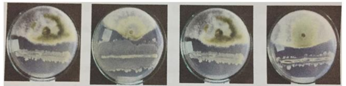
ISOLATE RBT84ISOLATE RBT86ISOLATE RBT88ISOLATE RBT89Figure 2. Performance of inhibition of Rhizobacterial Isolates from Cocoa Plantation in Kuala Tripa Sub-<br/>district, Nagan Raya Regency against Pathogens Causing Cocoa Fruit Rot (P. palmivora)

colonies. The results turned out to be the same as the results of analysis of variance (F Test) the rate of growth inhibition of the test pathogenic colonies in the rhizobacterial isolates from Glumpang Minyeuk Sub-district, Pidie Regency.