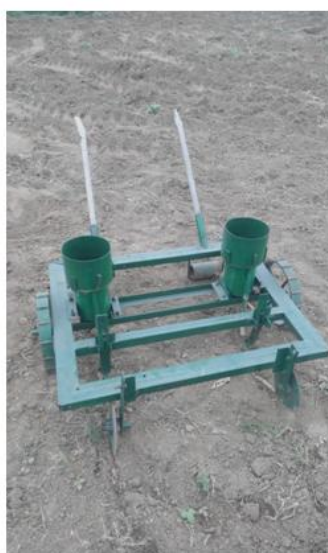
Fig. 2: Photograph of the fabricated pulse planter