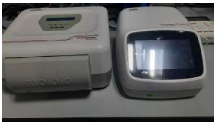
Fig 1: TrueNat Workstation

TrueNat PCR: Test was conducted on brain issue as per manufacturer's protocol. TrueNat work station consists of a nucleic acid extraction device and a PCR reaction analyser (Fig 1) along with accessories like RNA cartridges and microchips. It is portable, battery operated and can run 6 hrs on single charge. The whole procedure from RNA extraction from samples to final reading of result takes about 90 minutes. The results are declared either as detected (high, medium, low or very low); not detected or as test invalid. Ct value is also given (Fig 2) and one can visualize the reaction real time.