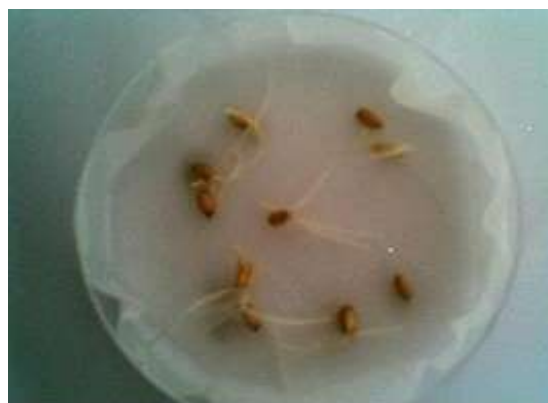
Fig.4 Petri plates with antifungal agent, after three days