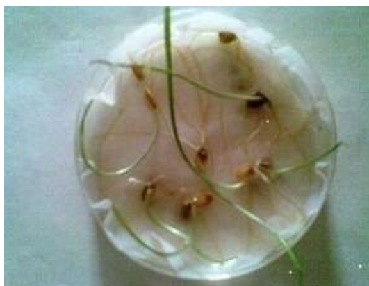
Fig.3 Highly infected seeds after 3 days irradiation with Diode laser