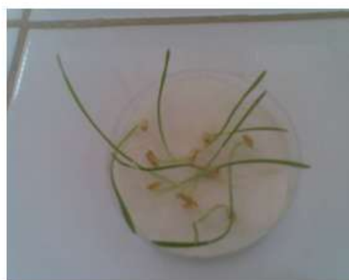
Fig.2 Seeds irradiated with SHG Nd-YAG after 3 days

Generally, SHG Nd-YAG laser significantly enhanced the germination percentage of wheat after 3 days to reach maximum of 93% after irradiation. For the percentage of non germinated seeds there were no important variations. On the other hand, there were high significant differences in resistant to fungi infection among the three types .Seeds irradiated with SHG Nd-YAG laser, no fungi infection was recorded Fig.2, while seeds irradiated by the two other types show highly infection especially after 3 days Fig.3, and the Petri plates which added to them antifungal agent show significant increase in infection with and without irradiation Fig4.