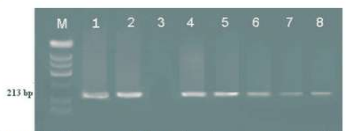
Fig. 2. Amplified product analyzed by 1.5% gel electrophoresis. Lane 1, 2, 8 positive amplification of brain, Lane 3 negative amplification from breast muscles, Lane 4, 5, 6 positive amplification from heart, Lane 7 Positive amplification from leg muscles, Lane M molecular weight marker 100 bp