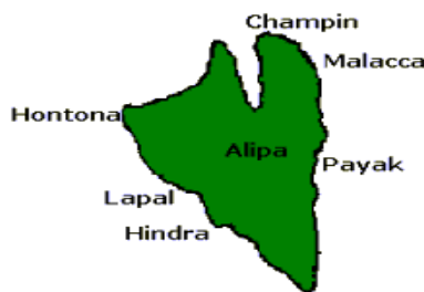
Fig. 4 Nancowrie island