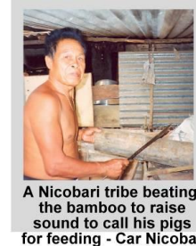
A Nicobari tribe beating the bamboo to raise sound to call his pigs for feeding - Car Nicobar