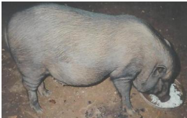
Fig. 16 Pig feeding on kitchen waste