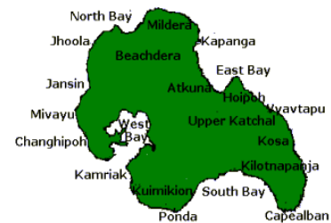
Fig. 3 Katchal island