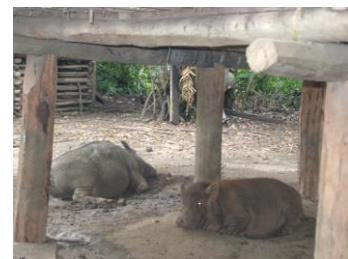
Fig. 9 Shelter for pig beneath hut