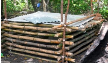
Fig. 10 Bamboo shelter for piglets