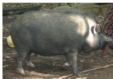
Fig. 8 Adult Nicobari pig