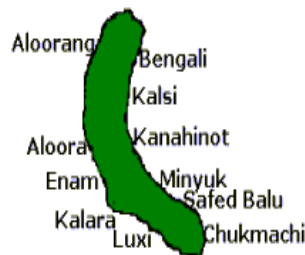
Fig. 5 Teresa island