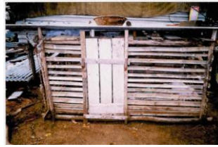
Fig. 11 Shelter for young pig