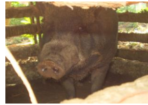
Fig. 12 Wooden cage for adult pig