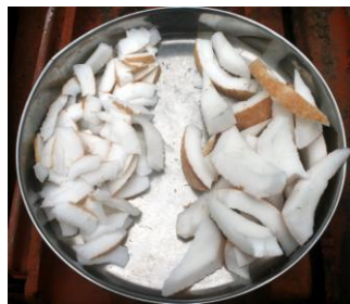
Fig. 20 Fresh coconut slices for pig