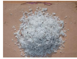
Fig. 18 Oil extracted coconut as pig feed