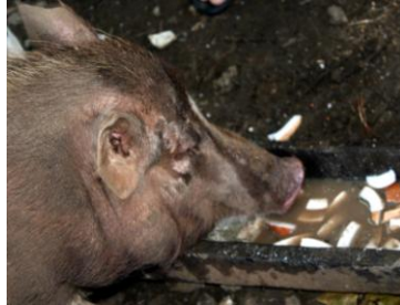
Fig. 14 Pig feeding on coconut