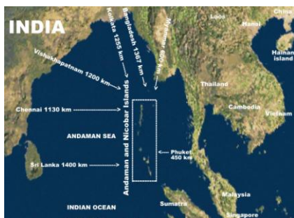
Fig. 1 Andaman and Nicobar islands with neighbouring countries