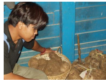
Fig. 21 Nicobari alu as pig feed