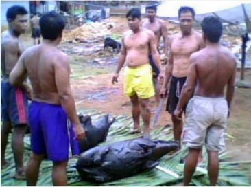
Fig. 13 Pig slaughter and dressing