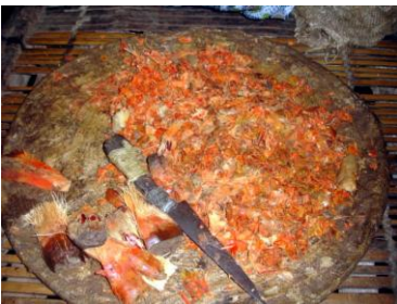
Fig. 19 Pandanus fruit waste as feed