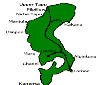
Fig. 6 Kamorta island