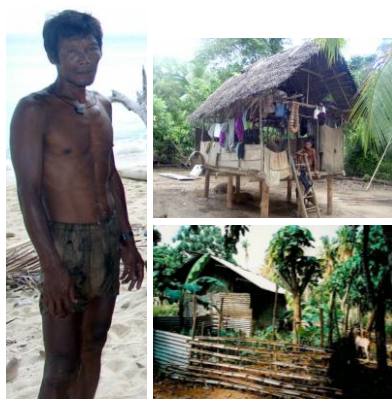
Fig. 7 A Nicobari tribe and their traditional Shelter with home garden at Car Nicobar and Teresa island