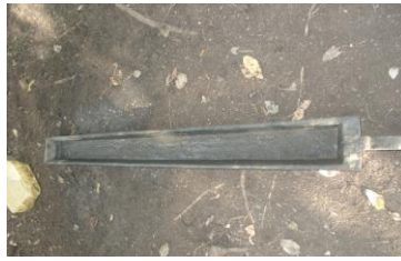
Fig. 17 Pig feeder ( naam )