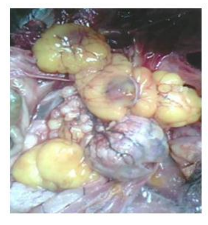
Figure 1:Highly enlarged nodular and lobulated ovarian tumor