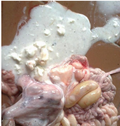
Fig 1 Abomassum on opening filled with clotted milk