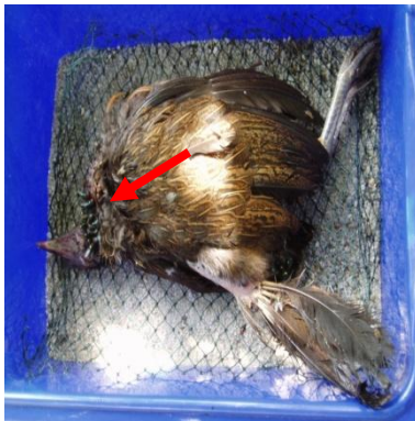
Figure 1: Flies attracted to slaughtered site (Group 2)