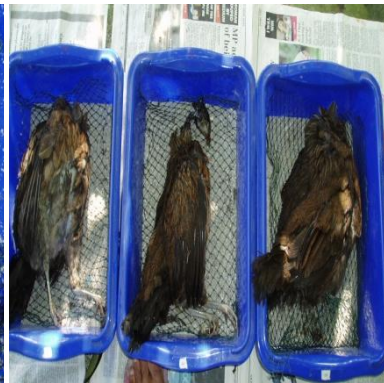
Figure 3: Carcass that did not disintegrate (Group 1)