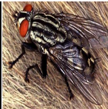
Figure 5: Sarcophaga sp