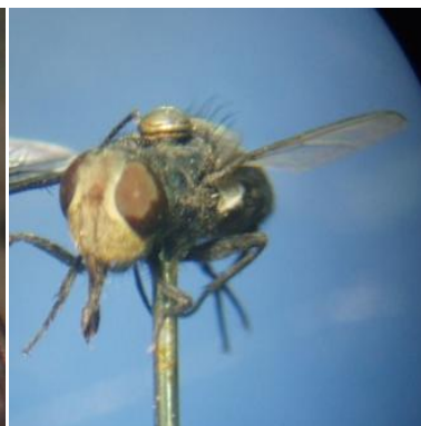
Figure 8: Lucillia sp