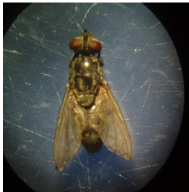
Figure 4: Musca domestica