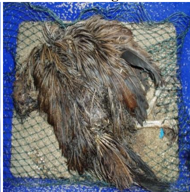
Figure 2: Total disintegration of carcass (Group 2)