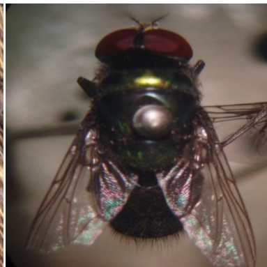
Figure 6: Calliphora sp