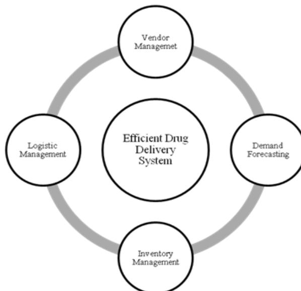
Figure 4: Model for efficient drug delivery system