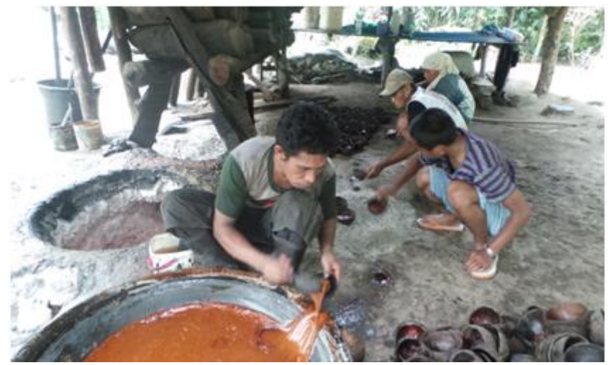
Figure 3. Thickening Process Palm Sugar and Ready to be Printed