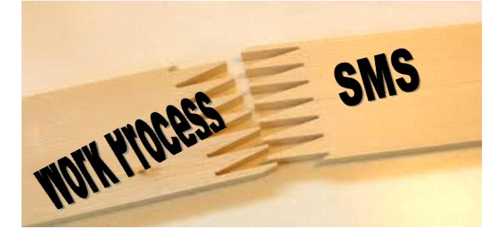
Figure 2: Illustrating the converse integration of work process into the safety management system

Based on the findings of the study, it is necessary for the management of a typical Nigerian construction company to give an urgent attention to their safety management system with an intense interest to standardise its operations and functionality. The integrated "PCR" safety model, based on the "TAB" philosophy is thus recommended to drive construction safety performance upward. In brief, the model suggests, as illustrated in figure 2 below, that the entire work process must totally an systematically fused/integrated into the safety management system and vice versa.