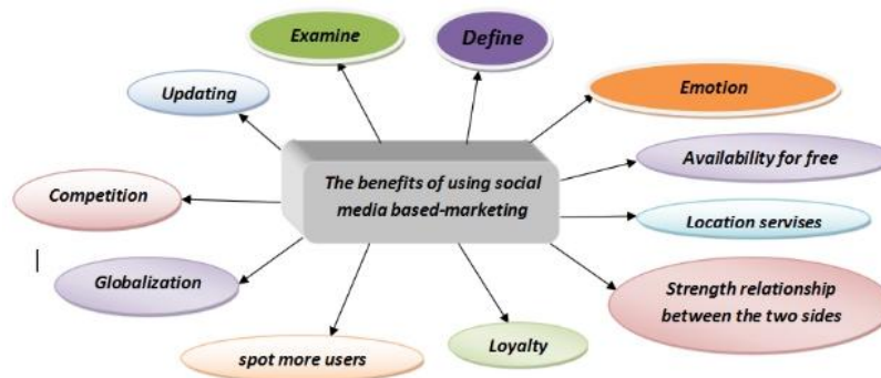
Figure 2 General benefits of using social media based-marketing for universities