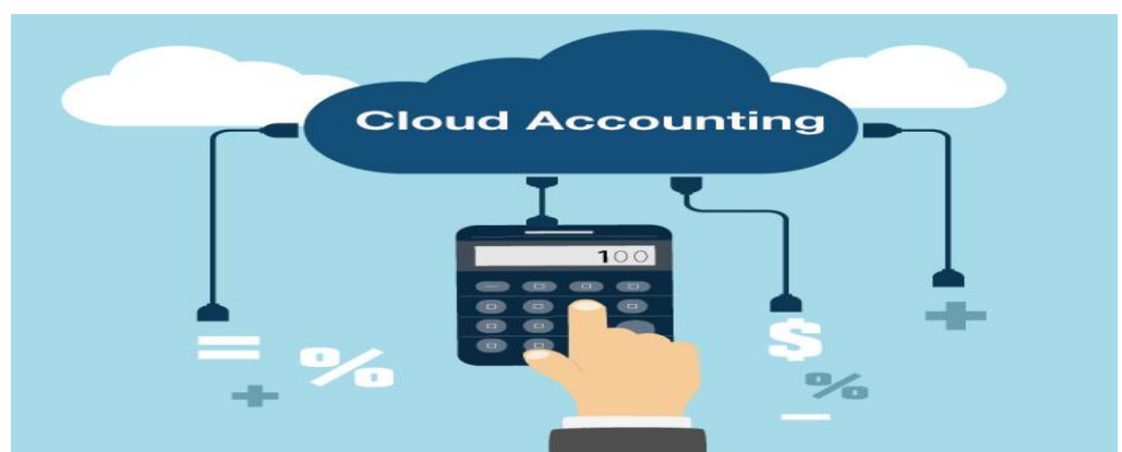
Figure 1: cloud accounting

One of the biggest technological trends at the moment is the emergence of cloud technology. The cloud is a platform to make data and software accessible online anytime, anywhere, from almost any device having an internet connection. In cloud computing, users access software applications remotely through the internet or other network via a cloud application service provider. Likewise, in cloud accounting, data is sent into "the cloud", where it is processed and returned to the user. All application functions are performed off-site, not on the users' desktop, which frees the business from having to install and maintain software on individual desktop computers.