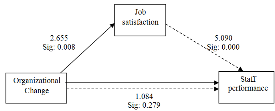
Fig 2. Mediated effects of job satisfaction on the influence of organizational change on staff performance

Fig. 2 shown the tests of mediated effect of job satisfaction on the influences of organizational change on staff performance based on the framework of Baron and Kenny (1986). As shown by Figure 2, the value of estimated path coefficient between organizational change and job satisfaction obtained was 2.655, while the job satisfaction's estimated path coefficient on employee performance was 5.090. The estimated path coefficient between organizational changes and employee performance was 1.084. Since the organizational change has no influence on employee performance, while the effect of organizational change on job satisfaction was significant at the 1% level and the effect of job satisfaction on employee performance was also significant at the 5% level, thus it can be concluded that the job satisfaction variable acted as a full mediating effect of the organizational change on employee performance. These findings implied that the only way to enhance the staff performance is by giving the focus on improving job satisfaction on the bases of good management of organizational change.