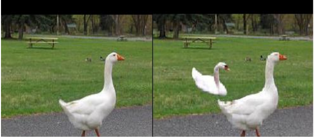
2a) Original image2b) Forged imageFigure2. An example of image splicing image forgery

In Image Splicing, two images are combined to create one tampered image or it is a technique that involves a composite of two or more images, which are combined to create a fake image [2]. Figure (2) shows an example of image splicing image forgery.