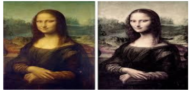
3a) Original image3b) Forged imageFigure3. An example of image retouching image forgery

In Image Retouching, the images are less modified. It just enhances some features of the image. There are several subtypes of digital image retouching, mainly technical retouching and creative retouching [3]. Figure (3) shows an example of image retouching image forgery.