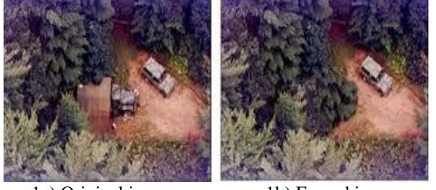
1a) Original image1b) Forged imageFigure1. An example of copy move image forgery

Basically there are three different types of digital image forgery: Copy-Move image forgery, Image Splicing image forgery and Image Retouching image forgery. In Copy-Move image forgery, one part of the image is copied and pasted on other part of the same image [1]. In other words, the source and destination of the modified image originated from the same image. This is usually done in order to conceal certain details or the duplicate certain aspects of an image. Figure (1) shows an example of copy move image forgery.