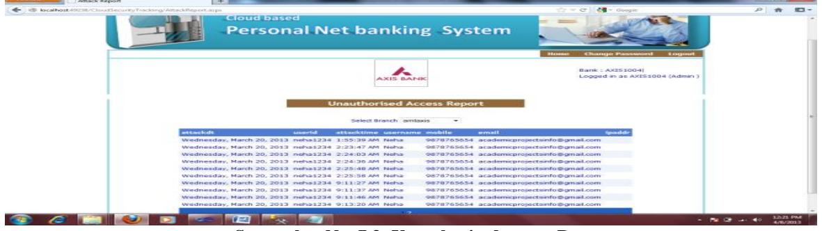
Screenshot No. 7.3: Unauthorised access Report

This is the home Page of cloud admin. He possesses six authorities.