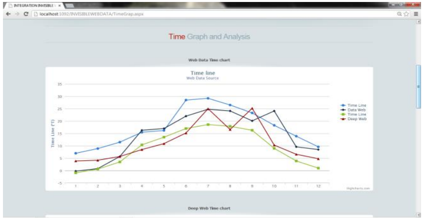
Figure 7: invisible web time line graph and analysis