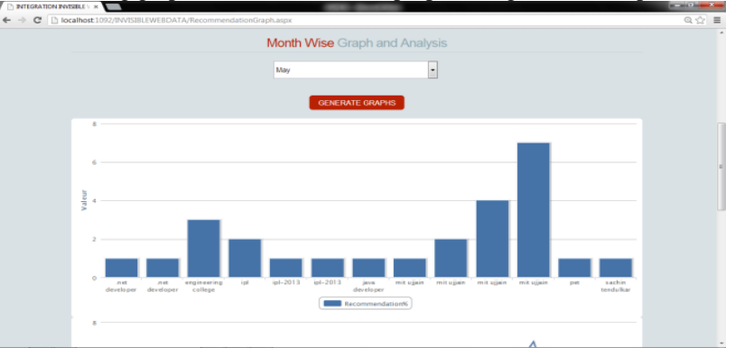
Figure 5: month wise graph and analysis

Result Analysis : The following graph shown the result of proposed algorithm with practical implementation :