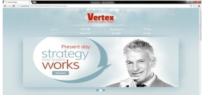
Figure 1: invisible web Search interface

Experimental result: The .NET Framework programming model that enables developers to build Webbased applications which expose their functionality programmatically. Developer tools such as Microsoft Visual Studio .NET, which provide a rapid application integrated development environment for programming with the .NET Framework.