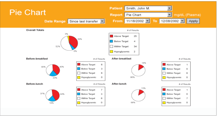
Fig.2Pie Chart of blood glucose level before and after food of patient

diabetes was based on paper and pen, pictorial evaluation of the patient healthcare was not possible and with cloud computing the doctors can make the pictorial analysis as shown in Fig.2,3,4,5. By storing the diabetes patient's medication history in cloud, analysis and diagnosis of his timely health care can be made available to the doctor 24x7 hours either through his mobile, IPad, Laptop or Desktop in remote areas. In-accordance with security issue, more rigorous research is supposed to be conducted in-order to make in an efficient cloud computing based healthcare for analysis and diagnosis of diabetes.