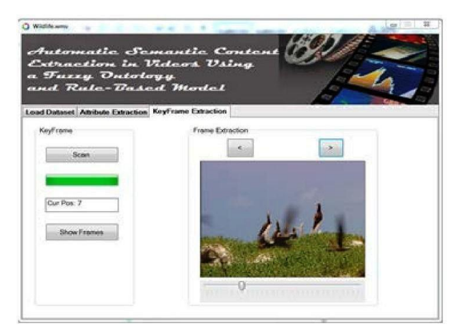
Fig: 3 No. of Frame