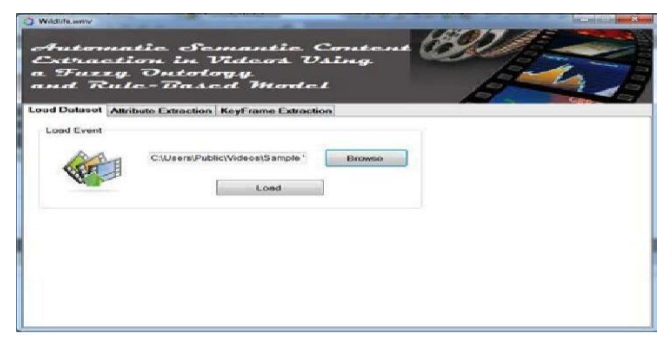
Fig: 2 Uploading Video

Once, the video file is loaded, it can be used for further computation and hence, initially, associated attributes are extracted of each loaded video file, where, general, audio-related and video-related attributes are extracted as shown in Figure 3 shows information about files successfully sent to neighbor i.e. from system to system.