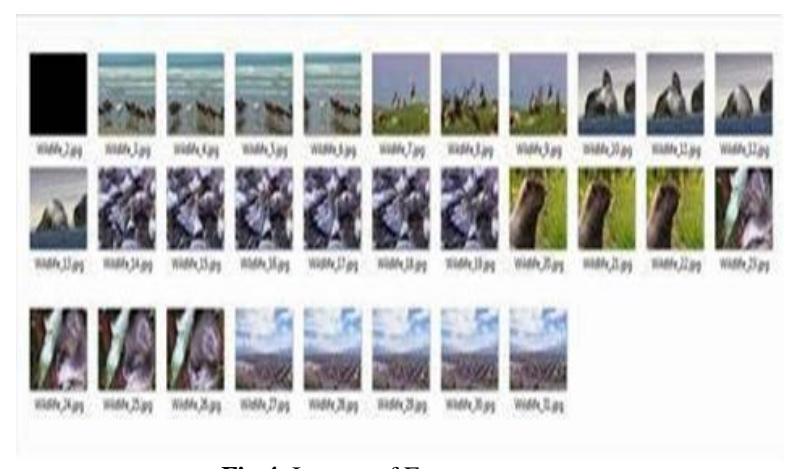
Fig 4. Images of Frames

Following Fig. 4 shows the 30 frames obtained on input video files like wildlife.wmv of duration 30 seconds and 04 frames obtained with capture_2012121.jpg file of 04 seconds video file. Similarly, the frame extraction for 10 video files is given in Table 1.