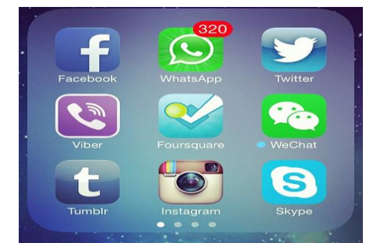
Fig: 2 sharing information by using different social media apps

Keeping in view of existing applications we offer novel features to proposed system that is sharing the information through social media applications. There are many social media applications available to share the information to the users some of them are Facebook, WhatsApp, Instagram, Viber, We Chat etc as shown in fig2. Directly from the m-health application we can share the information to our friend and family members by making use of social media applications.