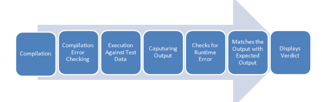
Fig. 1 Process involved in Online Judge

Section 2 elaborates the data gathered via the various related work done in the fields of online judges and its applications and cloud computing environment security issues, algorithms and management.