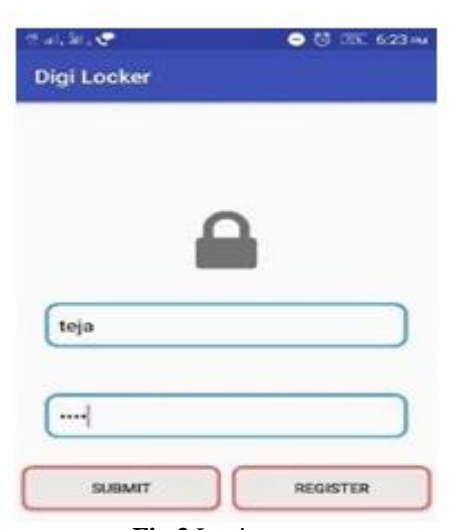
Fig.3 Login page

The figure illustrates the registration page of Secure Digi Locker Application, where user give their credentials and sign up for login page.