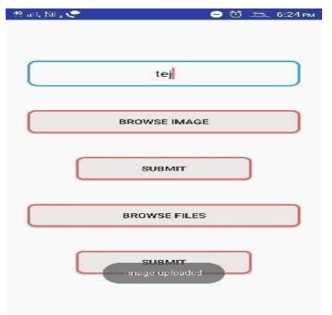
Fig.5 Uploaded successfully

The figure illustrates that the images or files can be uploaded from phone memory. The user gives the file name and browse the images or files from memory and enters submit for uploading.