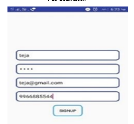
Fig.2 Registration page

The figure illustrates the registration page of Secure Digi Locker Application, where user give their credentials and sign up for login page.