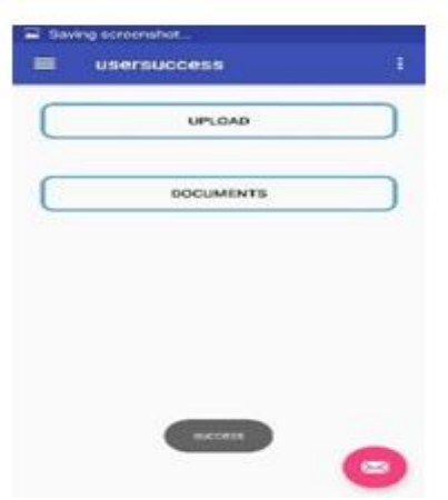
Fig.4 User Success Page

The figure illustrates the login page for an application, where user enters username and password to login successfully.