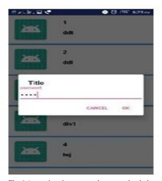
Fig.6 Accessing documents that are uploaded.

The figure illustrates that the images or files can be uploaded from phone memory. The user gives the file name and browse the images or files from memory and enters submit for uploading.