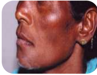
Fig.1: Extra-oral view: firm and hard swelling seen at angle of mandible.