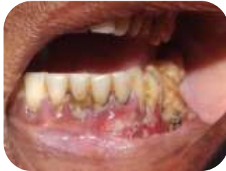
Fig.2: Intra-oral view showing ulcerative asymptomatic lesion.