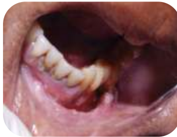
[1] Fig.3: Intra-oral view showing separation of vestibule and gingiva.