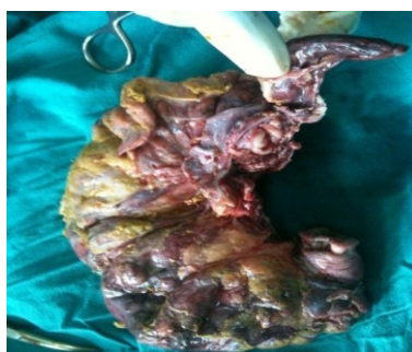
5. resected specimen showing ileum, caecum, appendix, ascending colon and proximal transverse colon