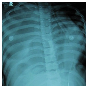
1. Xray chest showing right pneumothorax with shift of mediastinum to opposite side

An 11 yr old girl presented to the Pediatric Intensive care unit for acute onset respiratory distress. There was no history of previous abdominal trauma or any respiratory or gastrointestinal illness. On arrival in the PICU, the patient was tachypnoeic (respiratory rate 40 per min) and presented with peripheral cyanosis. The oxygen saturation (spo 2 ) on room air was only 75%, so she was put on ventilator immediately. Other vital signs were temperature 38.4 degree celcius, heart rate was 130 per minute and arterial blood pressure was 110/50mm Hg. Chest auscultation revealed diminished breath sounds on the right side. The abdomen was soft with decreased bowel sounds. Laboratory investigations revealed white blood cell count 14300 / mm 3 , blood urea 17 mg/ dl and serum creatinine 0.5 mg per dl. Chest x-ray showed large lucent right hemithorax with left mediastinal shift. The patient was suspected to have hydropneumothorax. A contrast enhanced thoracoabdominal Computed Tomography (CT) was performed. This examination showed right hydropneumothorax with herniation of dilated gut loops in the right hemithorax.