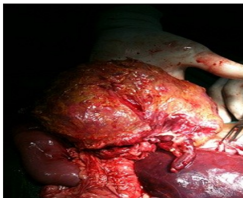
3. volvulus of ascending colon. appendix is also seen

Exploratory laparotomy was performed and terminal ileum, caecum, ascending colon and proximal transverse colon was seen to enter the right thoracic cavity. There were dense omental adhesions at the point of entry. Thereby, diaphragm was opened from a de novo site and 1.5 litres of faecal fluid came out. The posterolateral defect (Bochdalek) was then opened and contents visualised. There was present a volvulus of the ascending and transverse colon with perforation at hepatic flexure. Right hemicolectomy with ileocolic anastomosis was done. Chest tube was inserted and the diaphragm was repaired. Post operative chest x-ray showed full expansion of the right lung and the clinical condition improved rapidly after surgery.