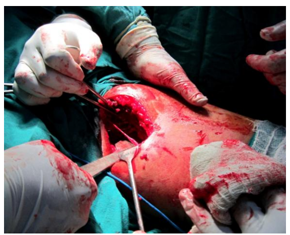
(Fig,6) showing surgical en block resection performed through Ludloff's approach