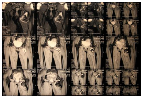
(Fig.-4) MRI of the hip demonstrates mass originating from lesser trochanter without any soft tissue extension and malignant degeneration but displace the adjacent muscle and sciatic nerve