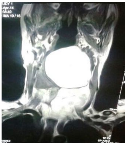
Fig 1. Preoperative MRI showing extensions of the lipoma