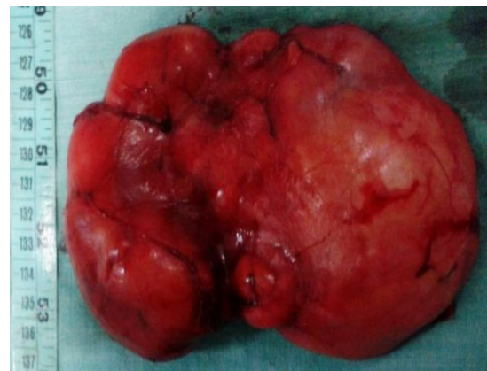
Fig 4. Post operative specimen