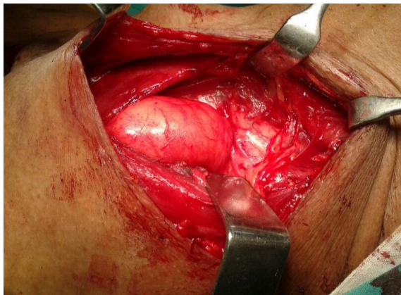
Fig 3. Intraoperative photograph showing the lipoma