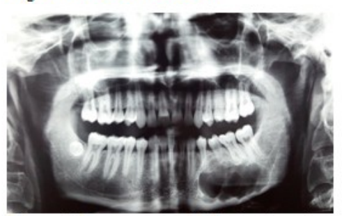
Figure 6: Post -operative OPG after 6 months.

Not many cases have been reported in the literature for the same. Under all aseptic conditions, the patient was intubated under G.A. & local anesthetic was infiltrated around lower anterior & posterior mandibular region on the left side. A crevicular incision was placed from the lower left side central incisor till second molar with bilateral releasing incisions. A full thickness muco-periosteal flap was raised, the tumor mass was exposed (Figure 3) & through the opened window, the tumor mass was removed (Figure 4). Nerve avulsion was done to remove the remnants of IAN. The surgical site was irrigated with betadine & saline. Hemostasis was achieved & closure was done with 3-0.