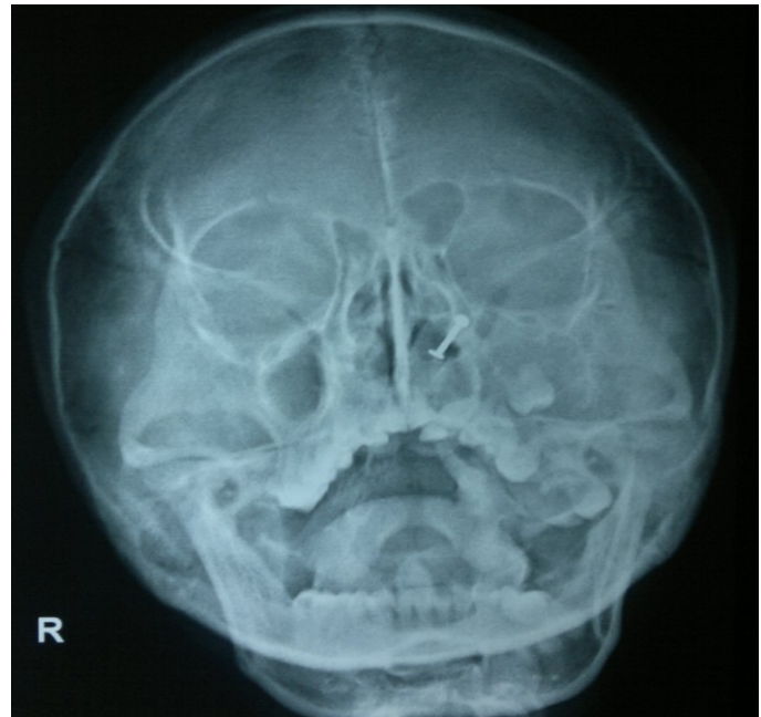
Fig 3: PNS view showing maxillary sinus infiltration with displaced teeth