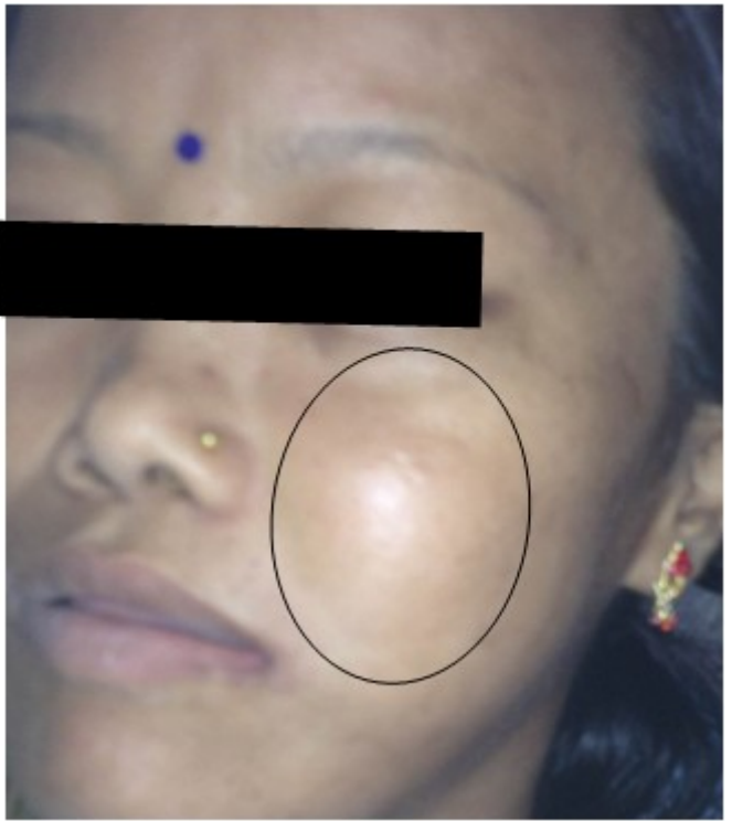
Fig 1: Showing extra oral swelling