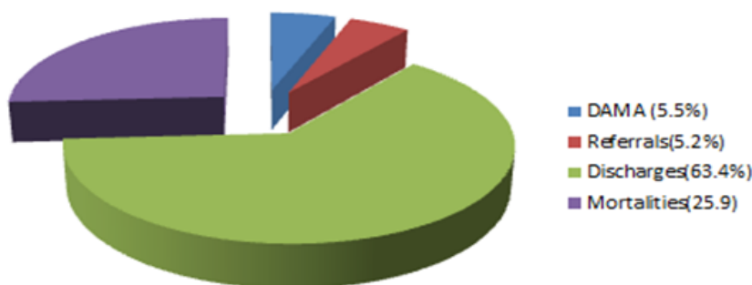
Figure3. Morbidity pattern.

The major causes of admission were perinatal asphyxia, Sixty-two patients (18.9%), neonatal sepsis, 108 (32.9%), neonatal hyperbilirubinaemia, 11 patients (3.4%) and prematurity, 78 (23.8%). Neonatal tetanus accounted for 4 (1.2%) of the total admissions while others (congenital anomalies, birth trauma, macrosomia, dehydration fever, haemorrhagic disease of the newborn and merconium aspiration syndrome) constituted 65 (19.8%) admissions into SCBU. Figure 3 demonstrates the morbidity pattern.