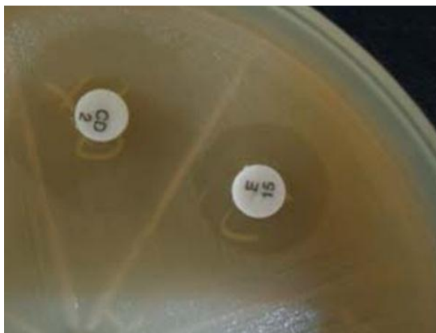
(Figure-4) Sensitive isolate. E-erythromycin 15 µg disc; CL-clindamycin 2 µg disc