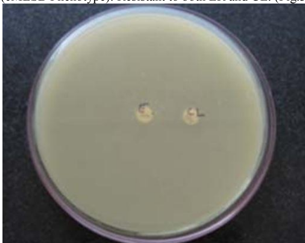
(Figure-3) Constitutive resistance to clindamycin

Constitutive Resistance (cMLS B Phenotype): Resistant to both ER and CL. (Fig.3)