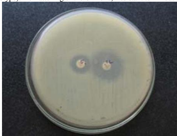
(Figure-2) D test negative isolate, resistant to erythromycin and sensitive to clindamycin

D Negative (MS B Phenotype): No flattening of the CL zone; Resistant to ER but susceptible to CL.(Fig.2)