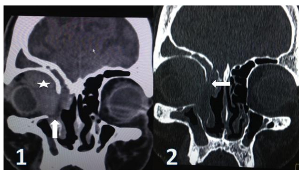
Fig1- Coronal CT section (soft tissue window) of the orbit shows a soft tissue density lesion (marked by star) on the medial aspect of right orbit in the region of lacrimal sac and medial rectus muscle and seen extending up to inferior nasal cavity and maxillary ostium (marked by block white arrow)