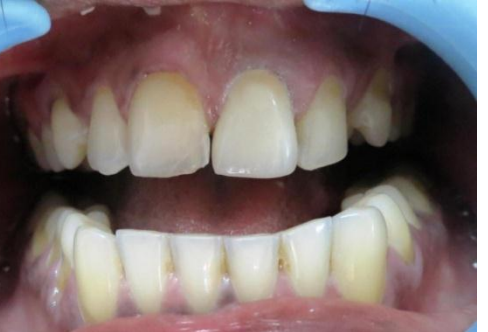
Figure6- PFM crown placement