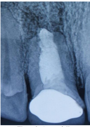
Figure8- 1 year follow up