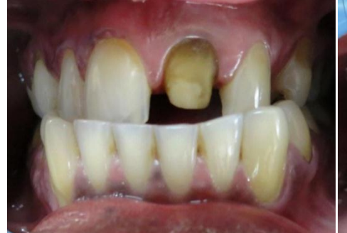
Figure5 - Tooth preparation