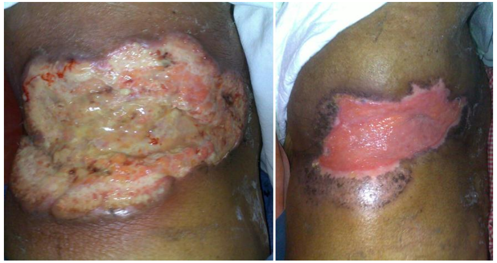
Figure 9. Loin Ulcer healed with sugar dressing.