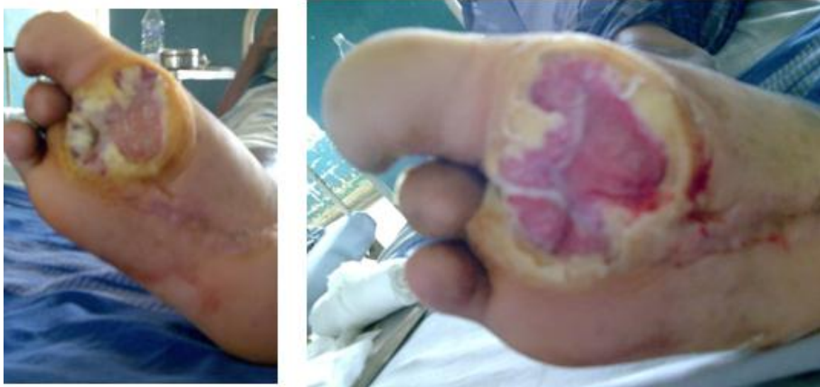
Figure 5 .Pressure sore of the foot healed with sugar dressing