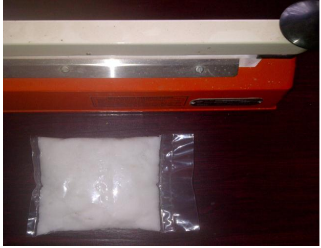
Figure 11 .Packing of sugar dressing material in sealed plastic covers for individual patients .