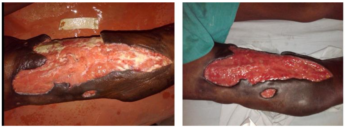
Figure 4 . Necrotising Fascitis of the Thigh Desloughed with serial sugar sugar dressing