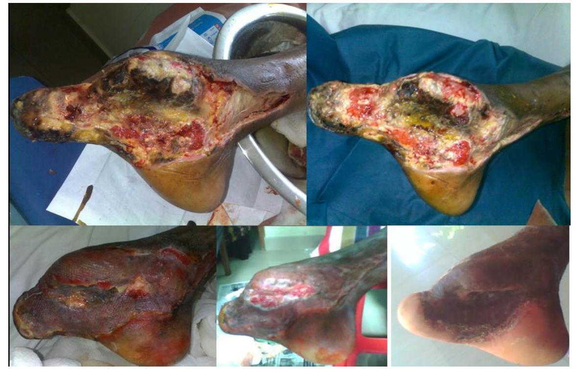
Figure 10 .Diabetic foot infected with Aspergillus niger. Patient received intravenous Amphotericin and serial sugar dressing. There was partial skin graft loss which later covered up.