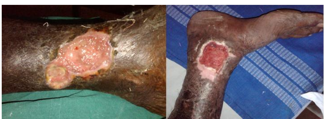
Figure 3. Venous Ulcer Healed with sugar dressing

After the initial debridement both sugar and honey dressings were applied to the wounds. The groups were comparable in terms of age ,number, comorbidity profile and wound size .The Results & characteristics of the Wound Healing are shown in Table 1. There was a significantly better healing with sugar dressing in terms of reduced duration of hospital stay ,rapid desloughing rate, and microbial clearance. Though making sugar paste was little expensive than purchasing Honey Sugar dressing worked out economical on the long run. The sugar paste was made separately for each patient were stored in sterile plastic containers or sachets were used for 3 months .When duration of hospital stay ,number of debridements and dressings were audited for cost ,sugar dressing was preferable .The Pictures of the Wounds healing with Sugar dressing is shown below.