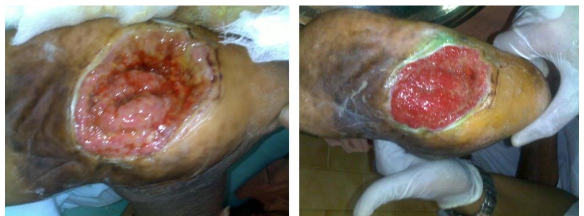
Figure 8.Plantar Ulcer Healed with Sugar Paste