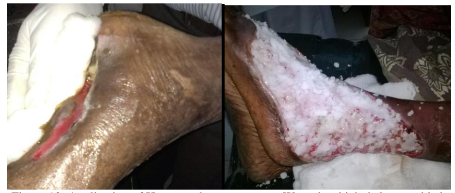
Figure 12. Application of Honey and sugar paste on Wounds which is later padded.