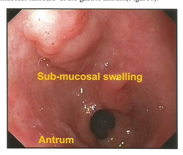
Figure 1: Upper Gastrointestinal endoscopy showing two submucosal swellings in the gastric antrum.

A 84-year-old woman had recurrent upper abdominal discomfort for the last six months. She had malaena following which she underwent upper gastrointestinal endoscopy one week later on her grandchildren's insistence. It reveals two submucosal tumours at the gastric antrum(Figure 1).