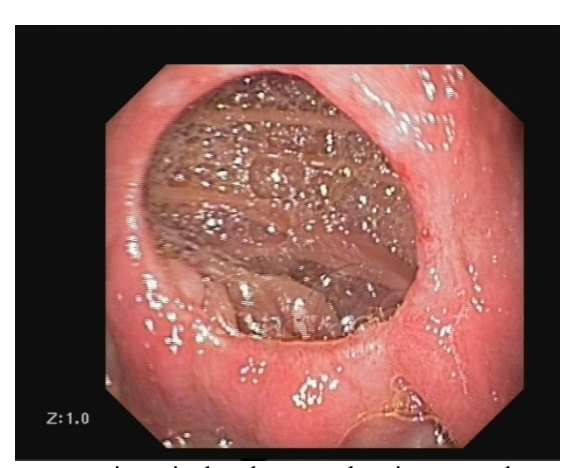
Figure 3 : Post operative upper gastrointestinal endoscopy showing normal gastrojejunostomy anastomosis.

Patient had an uneventful recovery except for mild satiety and bloating which resolves gradually after 2 months. Follow-up endoscopy 6 months later reveal no abnormality (Figure 3).