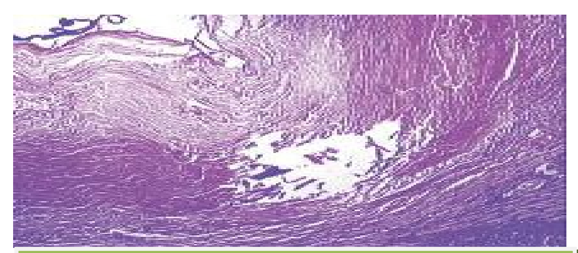
Figure-6:- Microscopic appearance . (Inside cyst, scolices are seen in the form of invaginated tubules & cuticular lining. Surrounding fibro connective tissue shows acute inflammatory infiltrate)