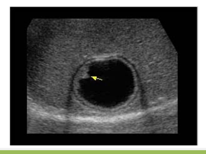
Figure-3:-USG showing cystic lesion in left arm with small

Complete laboratory data was normal. Indirect hemagglutination test for E.granulosus was positive. No calcification seen on plain radiograph. Ultrasonography (USG) revealed a hypoechoic lesion of size 4x1.9 cm in left arm seen involving anterior fibres of left brachial is muscle extending upto subcutaneous soft tissue plane. In visualised swelling a small anechoic cystic lesion of size 7x8 mm seen having a small calcified mural nodule suggestive of possibility of musclar hydatid cyst. ( Figure 3 ).