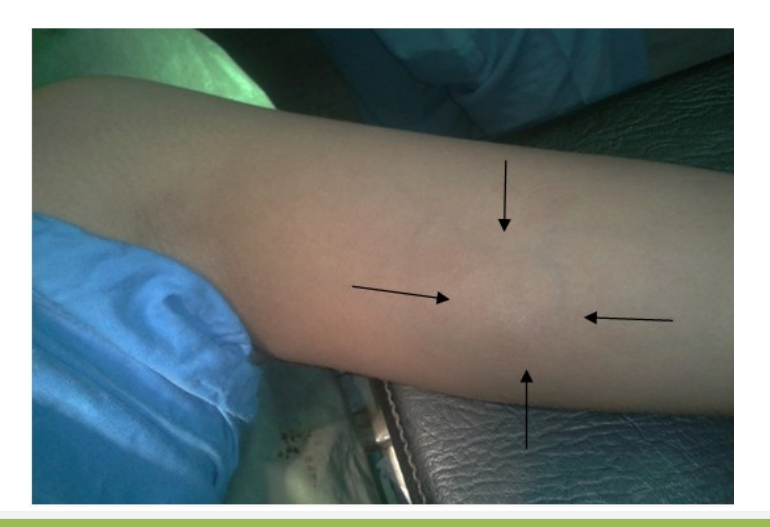
Figure-2:- Swelling over left arm

On local examination a single swelling of size aprox. 4 x 3-cm over medial aspect of left midarm, soft & nontender, fluctuant, nontransilluminant, and slightly mobile in both vertical and horizontal dimension with smooth surface and borders. Skin over the swelling was normal. There was no erythema, ecchymosis, increased warmth, or regional lymphadenopathy ( Figure 2 ). The elbow and shoulder had full range of motion. Distal pulses were equal in the both upper extremities. Other general and systemic examination was within normal limit