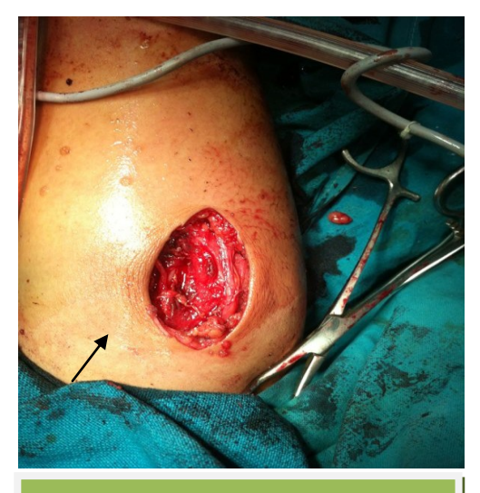
Figure-4:- Postoperative wound

Longitudinal incision was made directly over the swelling and tissues dissected uptil the cyst wall. The surrounding field was packed off to prevent contamination. We carefully started to dissect the cyst from the surrounding muscle outside the pericyst. But it ruptured inadvertently at one place revealing the daughter cyst ( Figure 4,5 ). Nevertheless the cyst wall was excised in whole. The wound was irrigated with hypertonic saline solution (scolicidal agent) and a suction drain kept.