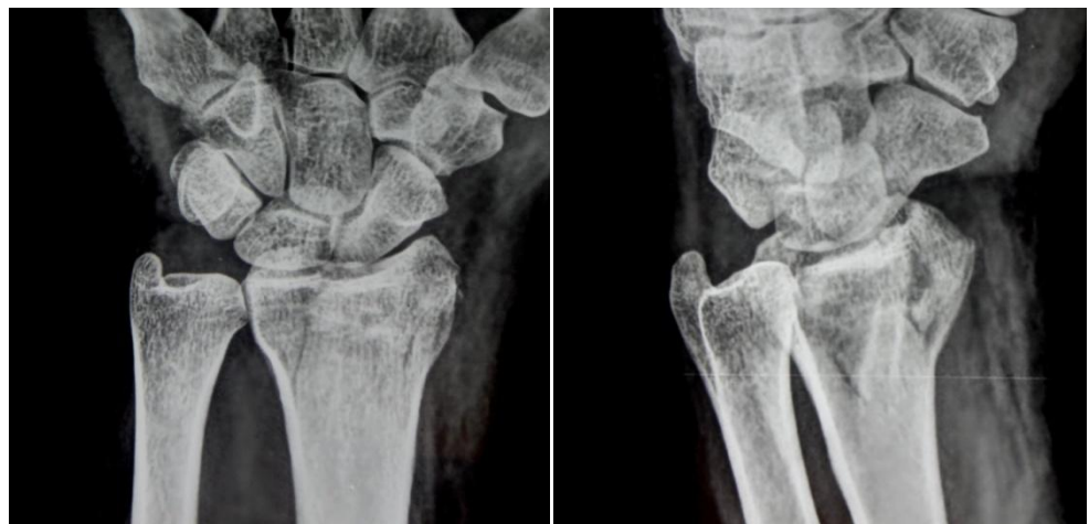
Figure 3(A) Showing intra-articular fracture. Figure 3 (B) Showing union at the end of eight weeks postsurgery.