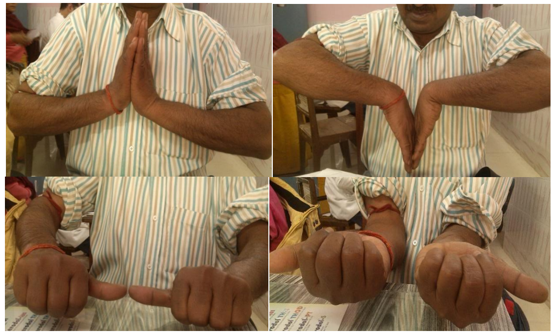
Figure 3 (C) Showing range of motion at the end of eight weeks postsurgery.