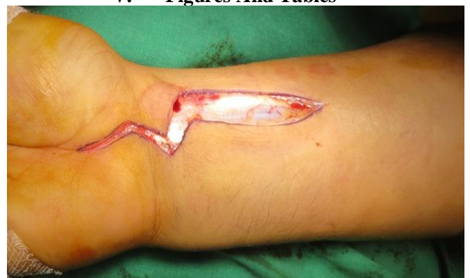
V. Figures And Tables