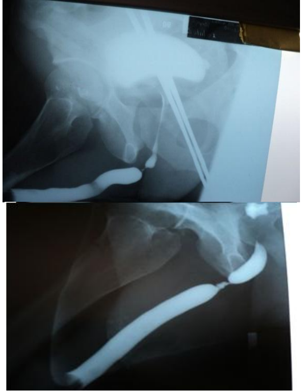
Figure 1: Urethrogram showing bulbar urethral stricture.

Operative management: Standard perineal anastomotic urethroplasty was employed.